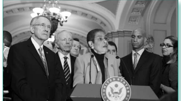
Norton pictured here with Sen. Majority Leader Harry S. Reid (Nev.), Sen. Joe Lieberman (Conn.), left, and D.C. Mayor Adrian Fenty, right, at a press conference discussing Senate passage of the D.C. House Voting Rights bill.

Today —A proposal for passing the D.C. Voting Rights bill has been submitted to House and Senate leaders. With the option to proceed later with our bill, we owed it to the city, where gun violence is always a serious problem, at least to explore the alternatives before concluding that there is no way to save any part of the District's gun safety authority. Stay tuned. Indefinite delay is not an option.