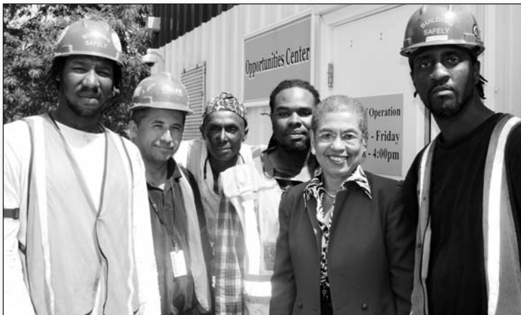
Norton stops at the DHS headquarters construction site in Ward 8 to investigate progress and hiring of D.C. workers.