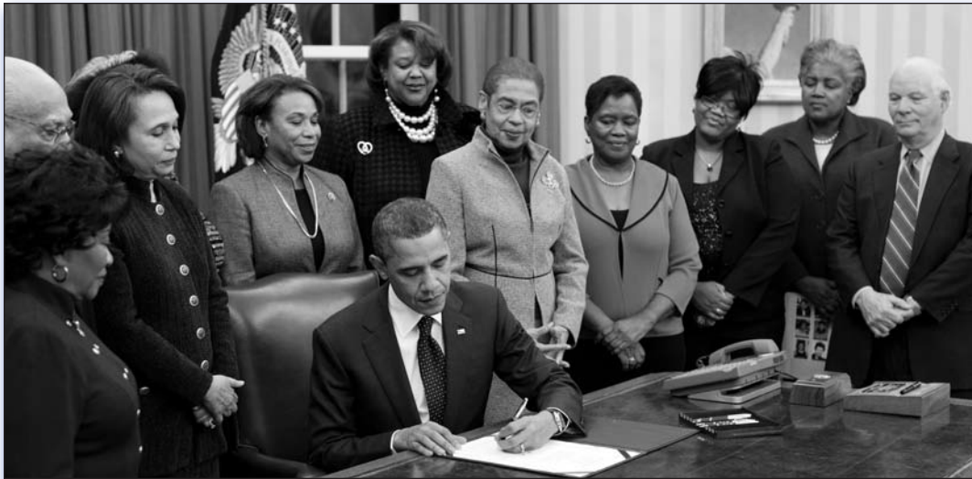
Norton looks on as President Obama in the Oval Office signs her Bill renaming D.C.'s Historic Post Office at Union Station in honor of Dr. Dorothy I. Height.